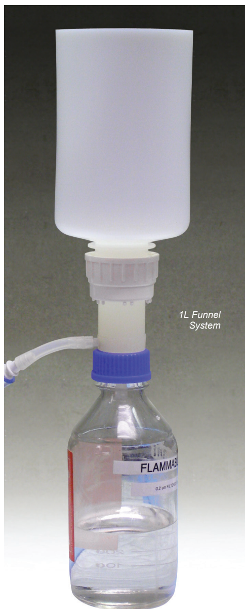
1L Funnel System