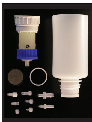
1L Filter Funnel System