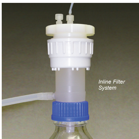
Inline Filter System