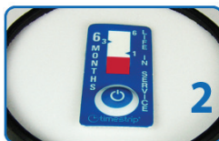
Replace when service life expires