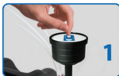
Push button to activate